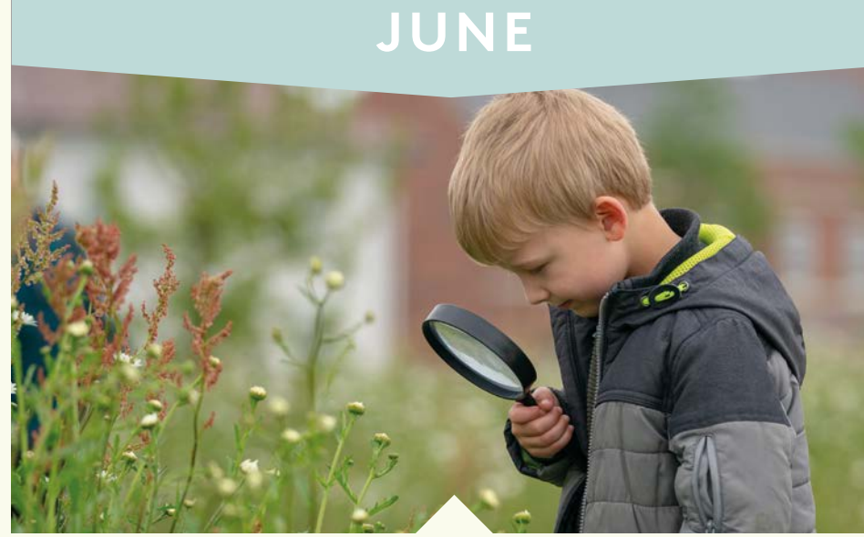
Creating the first phase of open spaces which includes miles of walkways and wildlife corridors