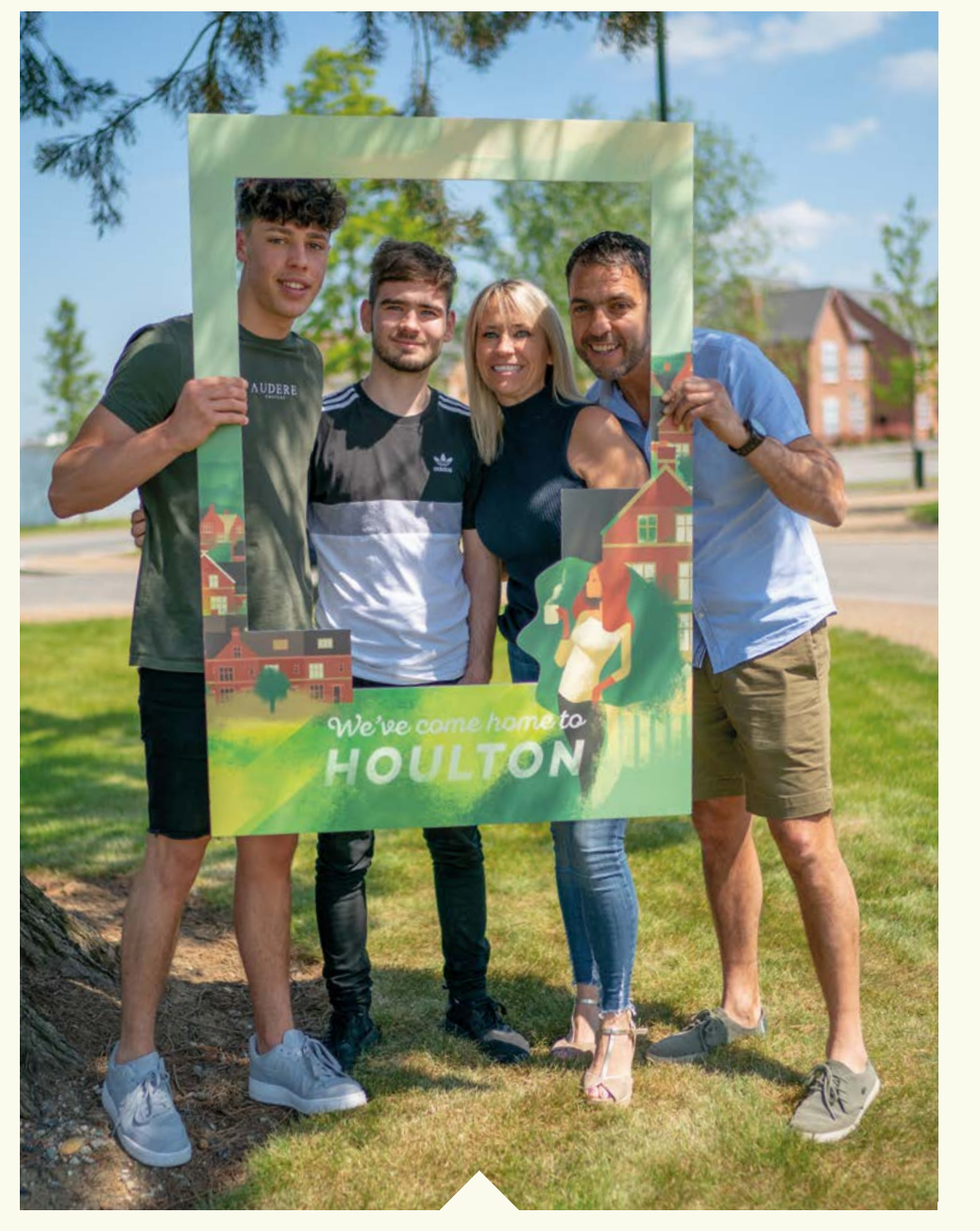
Welcoming our newest residents – and putting them in the frame about Houlton life