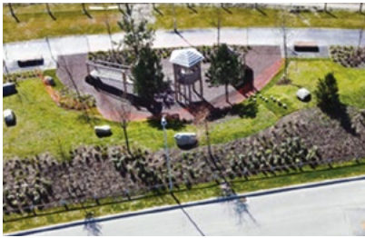
Bret Play Park