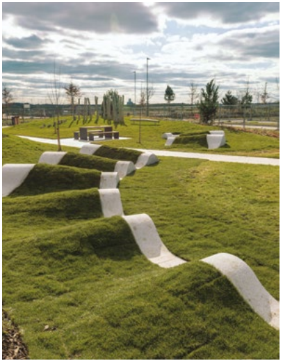
Ripple Play Park