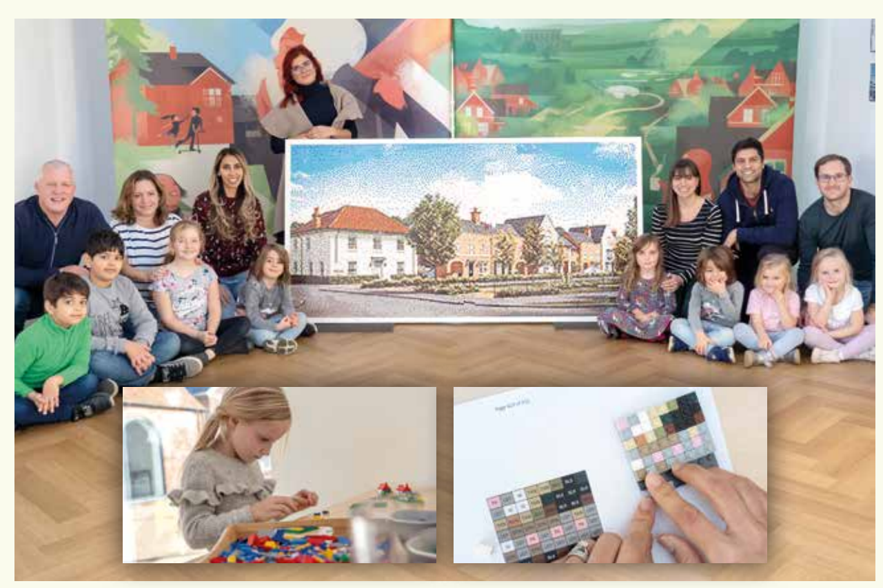
Houlton's family and friends create a Lego masterpiece

Children from Houlton have been busy creating a Lego masterpiece during the school holidays and have now put their final piece in place!