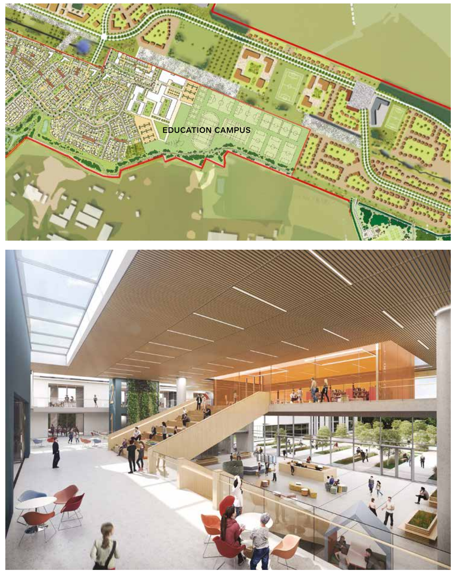
CGI of Alconbury Weald Church Academy

Location of the Education Campus at the heart of Alconbury Weald