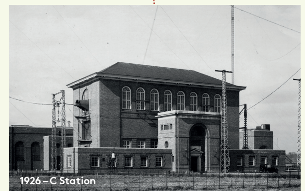
1926 - C Station