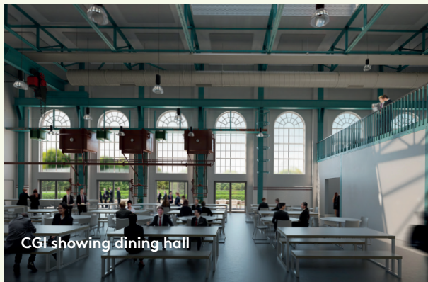
CGI showing dining hall