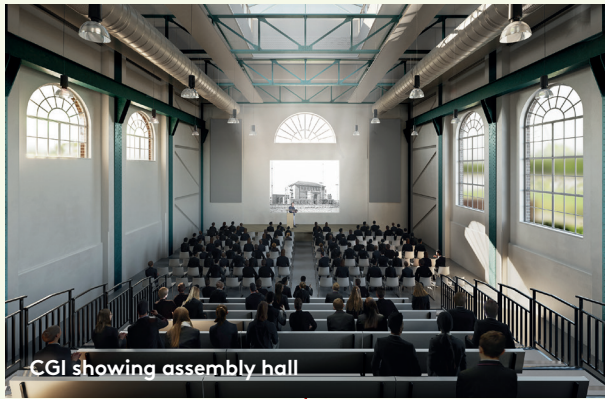
CGI showing assembly hall