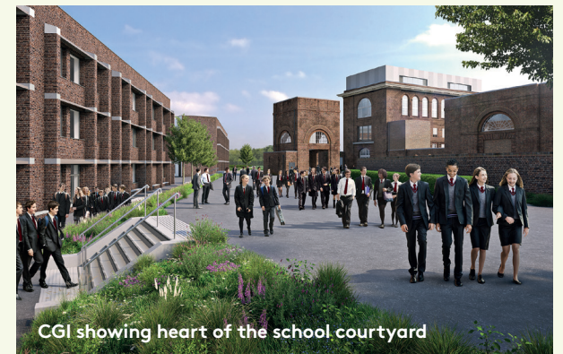
CGI showing heart of the school courtyard