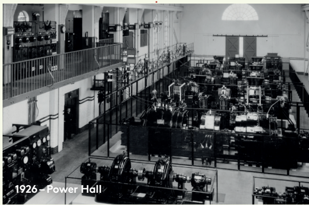
1926 - Power Hall