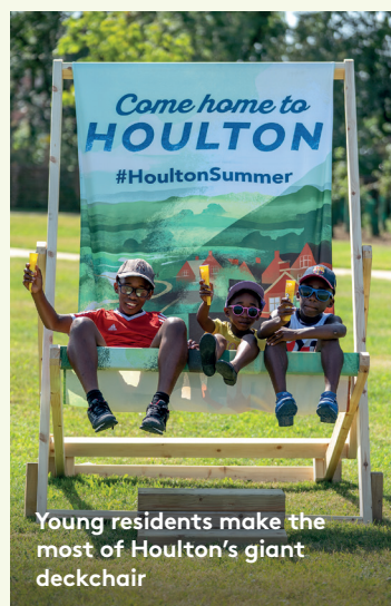
Young residents make the most of Houlton's giant deckchair

the country, the month saw some of Rugby's finest artists showcase their work across several weekends, and was an unmissable event for art-lovers in the area.