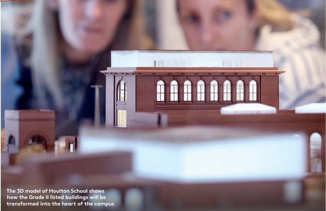
The 3D model of Houlton School shows how the Grade II listed buildings will be transformed into the heart of the campus