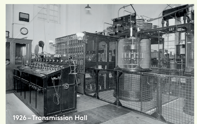
1926 - Transmission Hall