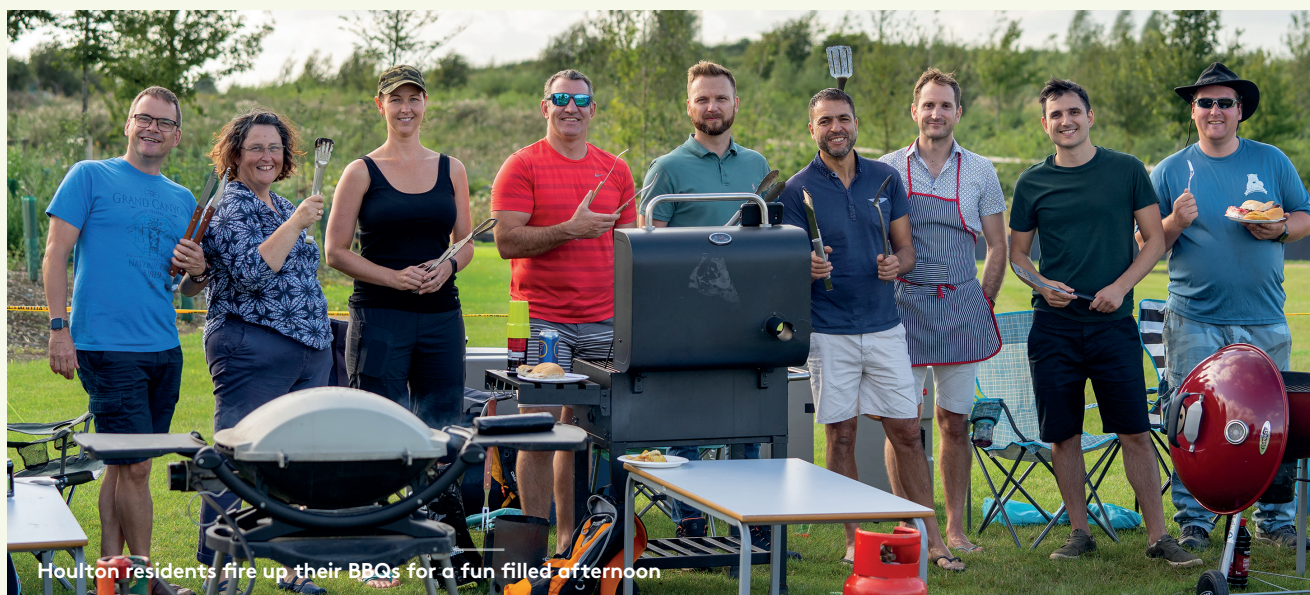
Houlton residents fire up their BBQs for a fun filled afternoon

July also saw a huge annual art event, Warwickshire Open Studios, come to The Barn. Involving over 300 artists at 151 venues across